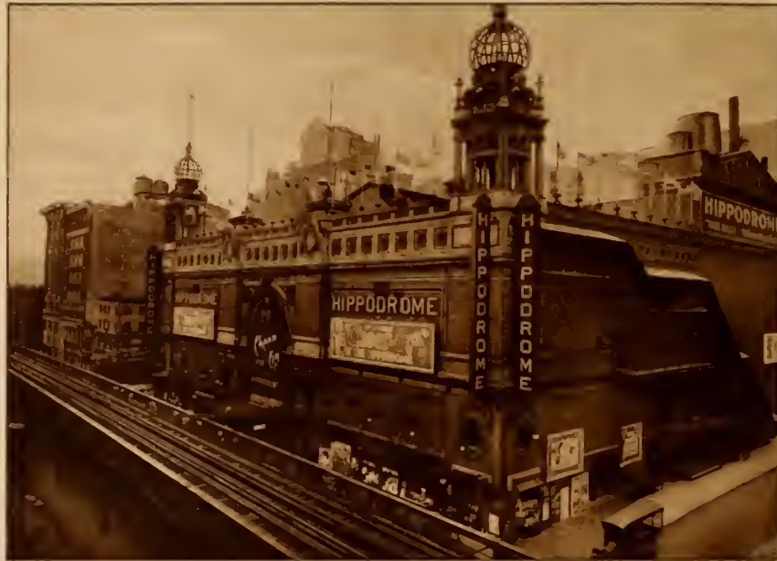
HIPPODROME. The largest theatre in New York City, seating 5200.